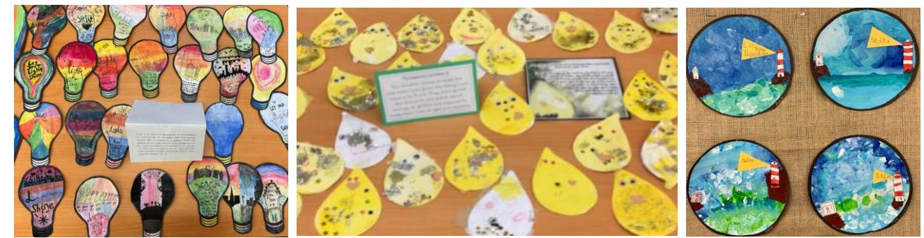
A selection of the children's art work depicting our vision

The year 6 class singing 'Let Your Light Shine'