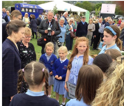
Princess Ann was clearly impressed

Meanwhile, back at Highnam many of our children have been helping to keep our school grounds smart. Thank you to Travis Perkins in Tewkesbury for donating bark, pipes and tarpaulin for our outdoor areas.