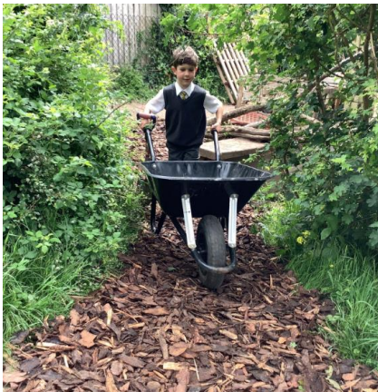
Busily laying the bark in the forest area

Meanwhile, back at Highnam many of our children have been helping to keep our school grounds smart. Thank you to Travis Perkins in Tewkesbury for donating bark, pipes and tarpaulin for our outdoor areas.