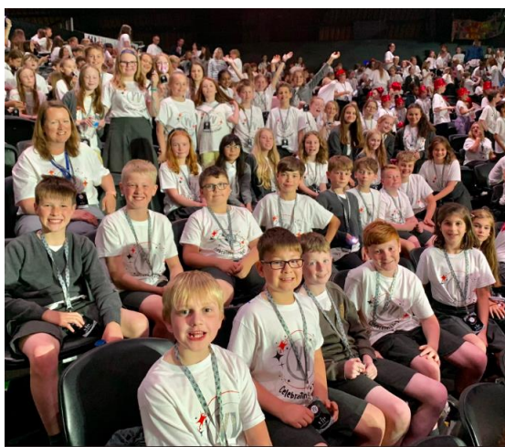
All ready to sing

Being part of the largest school choir in the world was truly a magical experience and the night included some amazing performances. What an incredible evening we had at Genting Arena in Birmingham – the children made memories that will last a lifetime! Thank you to all the parents that came along to watch, it was great to spot you in the audience!