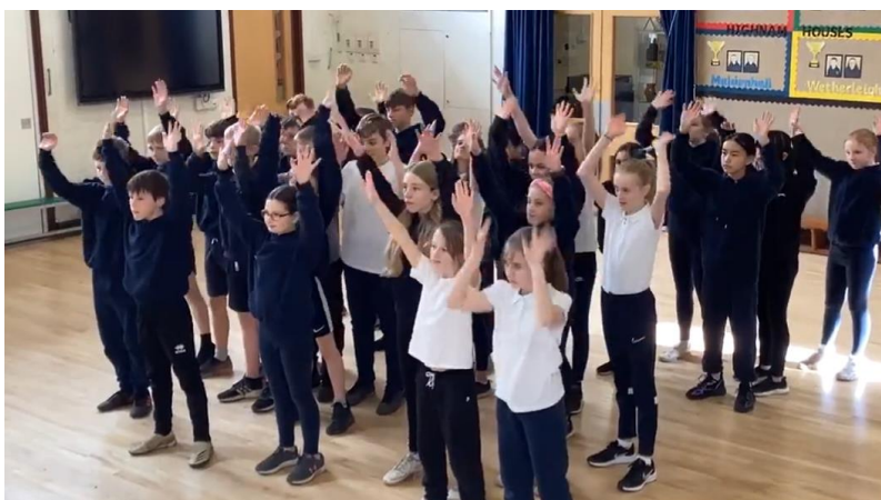
Year 6 performing their Nowhere Emporium dance

Dance Days spent the day at Highnam and worked with each class on a dance linked to a book. Reception focused on Handa's Surprise, year 1 and 2 on The Three Little Pigs, year 3 and 4 on Charlie and the Chocolate Factory and year 5 and 6 on The Nowhere Emporium.