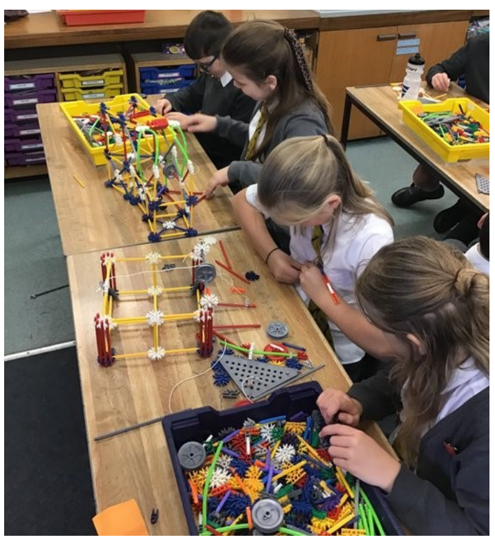
Year 6 pupils taking on the K'Nex challenge

Look out for the letters in windows around the streets of Highnam to create the words and have a great time!