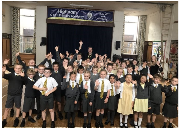
Our Young Voices Choir

If you haven't had a listen catch up with it on the school website!