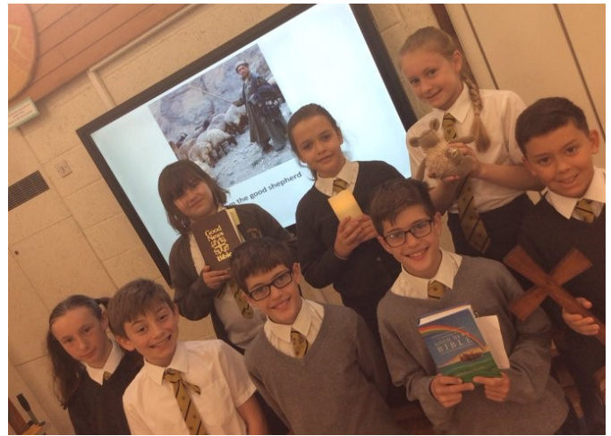
A few pupils from our Worship Council