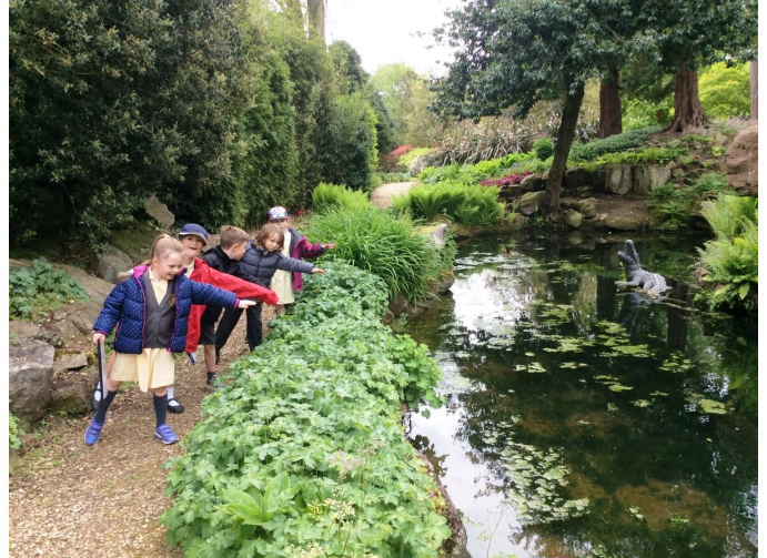
Discovering the Highnam Court gardens