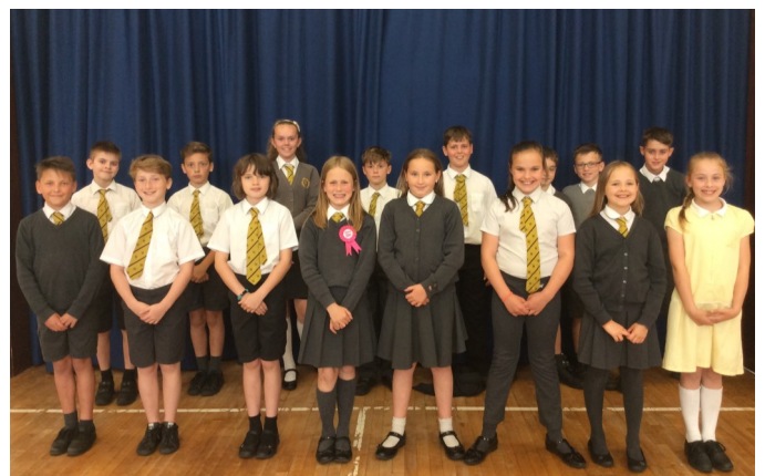
The Swimming Gala Finals Team