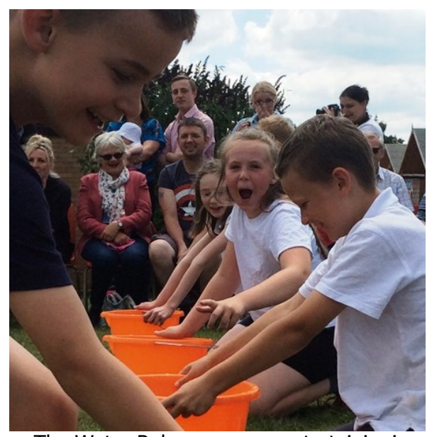
The Water Relay was very entertaining!