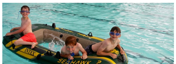
Enjoying the pools at the Lido last year