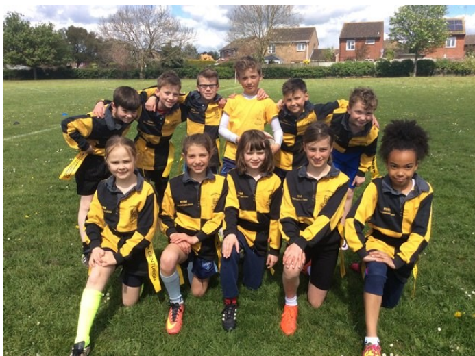
The Highnam Tag Rugby Team

On Tuesday 25th April Highnam hosted the Annual Tag Rugby Festival for pupils in Years 3 and 4. This year 4 other schools joined us: Churchdown Village Junior School, Hempsted, Redmarley and Staunton and Corse. The teams played in tricky conditions in one afternoon, one minute the sun was shining, the next it was snowing! It didn't put off the players and the festival was played in a great spirit. Congratulations to Hempsted who were overall winners. Well done to the Highnam team who finished in 3rd place.