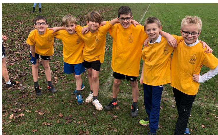
Some of the runners from Years 4 and 5