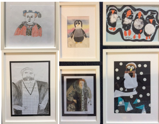
Beautiful artwork — well done!

The Art Wall of Fame is now complete and is expanding. Soon a new wall close to the current Wall of Fame will be populated with even more fantastic pieces of artwork. Some of the winning entries for the house art competition will also be displayed.