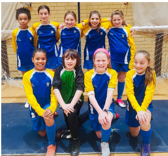
Well done team - a super effort